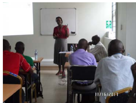
Hub bike riders during the Biosafety training

Hub bike riders move laboratory samples along the transport network. Using demonstrations and videos, hub riders were introduced to aspects of biorisk management, bioethics and code of conduct, personal protective equipment, decontamination, sterilization and disinfection, among others, during a training that took place from 16 th – 18 th November 2017.