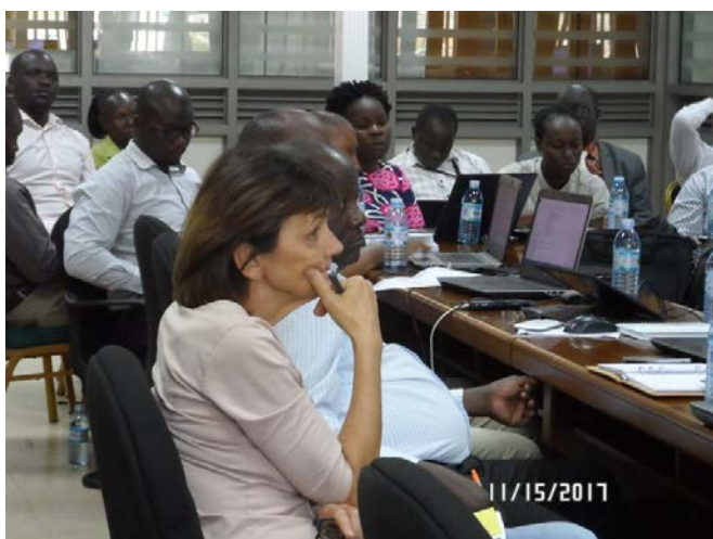
IP Laboratory advisors during a review meeting at Butabika

On 15 th November 2017, IP Laboratory advisors had a meeting at UNHLS Butabika, to review performance of individual IPs for the last six months and plan for the next six months.