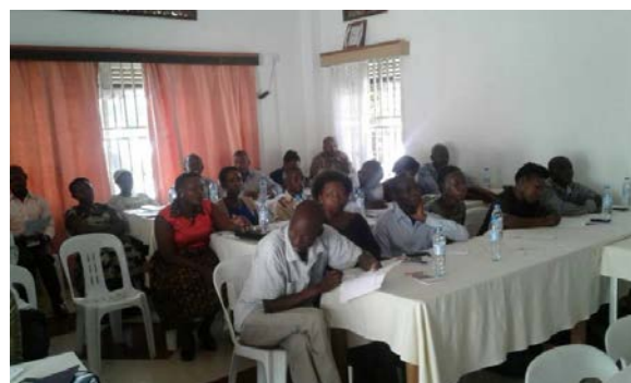
Health workers from Jinja and Masaka Districts during the TOT for POCT

On 20 th November 2017, there was a 3 days TOT for Jinja and Masaka districts about the national policy and guidelines, knowledge and skills related to the international standards leading to POCT accreditation and to equip health workers with quality related skills including; internal quality control (IQC), external quality assessment (EQA), Validation/Verification aspects.