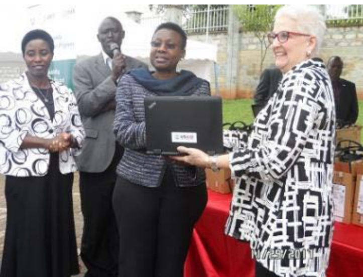
The U.S Ambassador to Uganda handing over computers to the Minister of Health