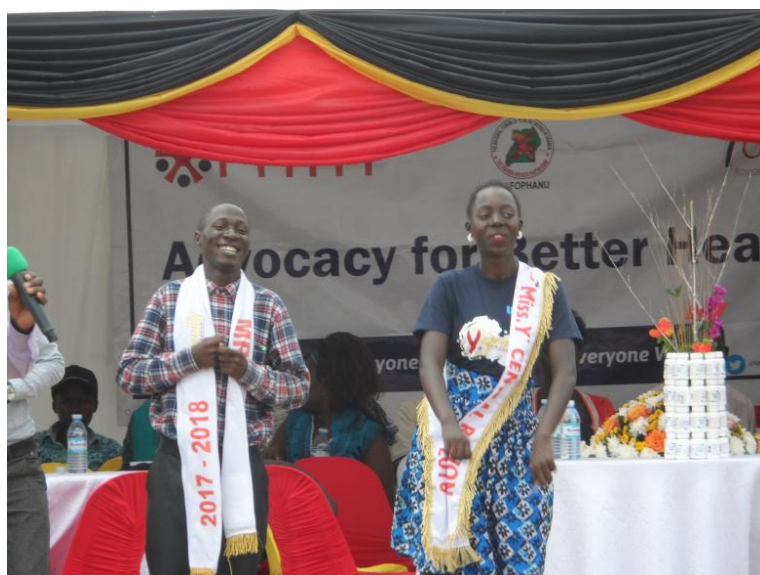
Mr and Miss Y+ who were born with HIV and are living Healthy during the Viral Load Awareness Camp at Butabika