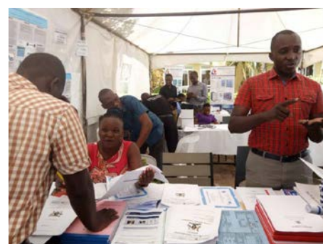
Exhibitors explaining ideas and products within the laboratory sector

On 1 st November 2017, UMLTA organized its annual scientific conference in Arua with the theme, "Laboratory Systems Strengthening for a Resilient Health System". There were presentations of annual findings and projects from UMLTA members including exhibitions of ideas products within the laboratory sector.