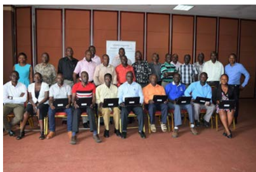
Some of the Lab Supervisors during the Launch of the database

On 22 nd November 2017, UNHLS in collaboration with USAID/Uganda Health Supply Chain Program officially launched this database after an extensive computer training of 42 Lab SPARS supervisors that begun on 13 th November 2017 at Silver Springs Hotel, Bugolobi. Training involved computer use and maintenance and utilization of Lab SPARS database. Each supervisor received a new Lenovo Yoga 11e ThinkPad Laptop and internet modem loaded with internet bundles to facilitate online access.