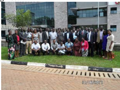
Masters and PhD Holders with the SMT at Butabika

On 16 th November 2017, identified masters and PhD holders had a meeting with UNHLS Senior Management Team (SMT) at Butabika where the idea of creating a profile was discussed. Among other ideas discussed was the establishment of a peer reviewed academic journal for the Laboratory Sector that meets international standards and support research work from academicians in Uganda.