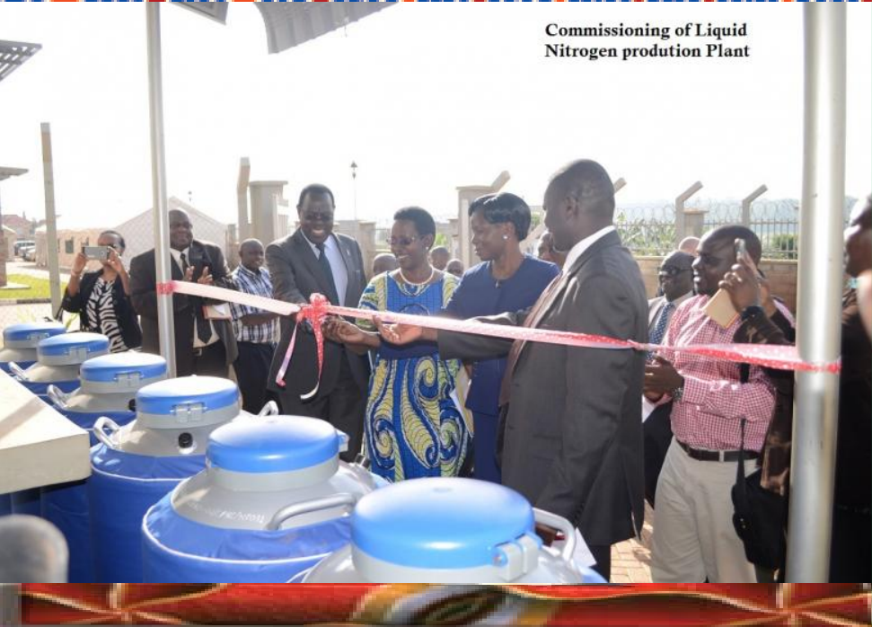
Commissioning of Liquid Nitrogen production Plant