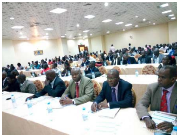
Stakeholders listening to a well attended update meeting

The implementation plan has items completed including; Policy & pilot plan in place, sites identified, procurement of products completed, assessment done and results shared in this meeting. Items remaining include; trainer of trainer (TOT), facility training, enrollment, collecting data to inform the scale up. The role of UNHLS is to; strengthen human resource capacity, monitoring error rates through coding the rates and automating their notification to national team that determines their magnitude and implication; coordinate logistics supply chain with NMS; conduct comparable testing (validation); data management & monitor consistence with EID programs tools and dashboard; and EQA. The pilot is intended to end by March 2018.