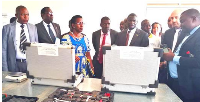
PS of MOH listening to Laboratory Calibration experts

Other activities for the Lab Day include; commissioning the liquid nitrogen manufacturing plant, receiving the UNHLS staff van from MAUL, handing over motor bikes to Hubs, and graduating 4 Biosafety cabinets certified Engineers among others.